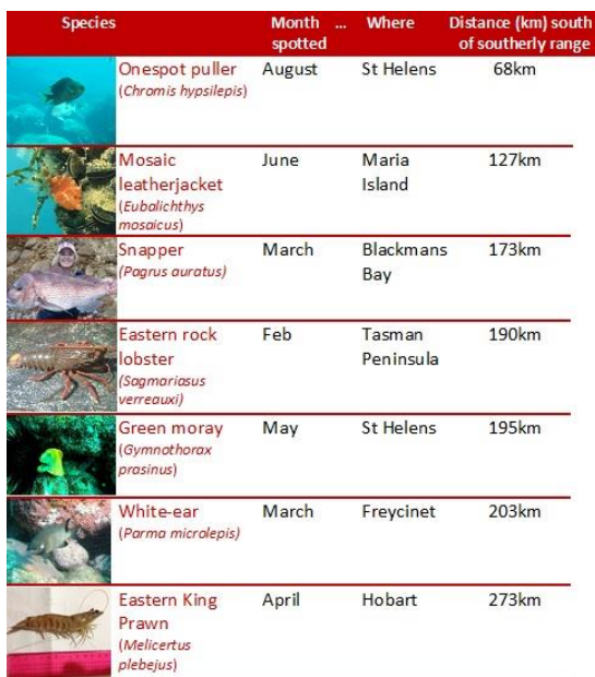
Table 4. Examples of sightings submitted to Redmap Tasmania that were ‘out-of-range’ i.e. south of their expected distributions

level of confidence in potential range extensions in Tasmanian species was estimated (Robinson et al. in press) and information on the raw data that is submitted to Redmap shows some individual sightings logged in Tasmania (Figure 1) and how far south they were spotted from their usual poleward range boundary (Table 1). Some observations are clearly significant: for example, the juvenile mosaic leatherjacket ( Eubalichthys mosaicus ) spotted off Maria Island by Redmap member Antonia Cooper in June this year (Plate 2). This species is not normally found in southern Tasmania in mid-winter. Juveniles of potential range-extending species recorded in colder months are particularly important as they indicate the prospect of species being able to survive (and therefore reproduce) throughout the year, increasing their likelihood of establishing a population (Bates et al. 2014).